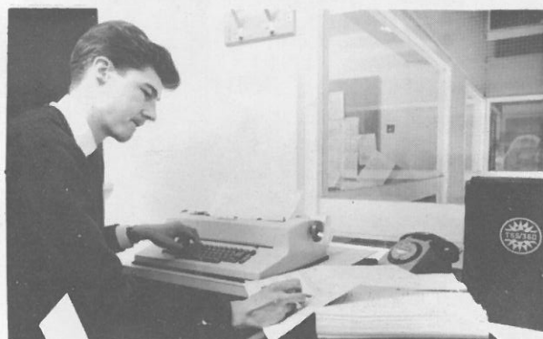
The users view of a modern computer a terminal for the time sharing System 360 Model 67 computer.

The majority of the demand on the computing system will arise from research workers in science, engineering and medicine, although other workers, especially in the bibliographic and social science fields, will make substantial demands. Although the needs for computer time for each student example are slight, the numbers involved produce an appreciable demand from this source also.