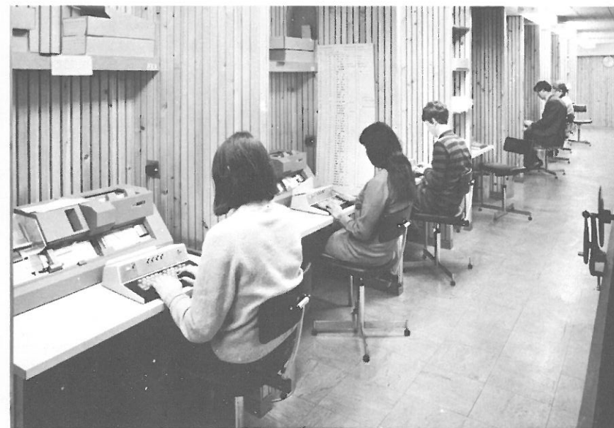
Data preparation in the Newcastle University Computing Laboratory

The arrangements for running the system are aimed to ensure that, after initial agreement on the general principles of operation, each University is free to adopt its own policy for the allocation of time and facilities among its members within its share (70% for Newcastle and 30% for Durham). The design of the 360, Model 67 and the programming systems to be employed permit this independent control of its use. The running costs are being provided by an annual grant from the Computer Board for early years of the system's operation. Systems programming, advisory and operating staff have been appointed in both Universities and will work with the programming and engineering staff from IBM (United Kingdom) Limited to provide the services that the users require.