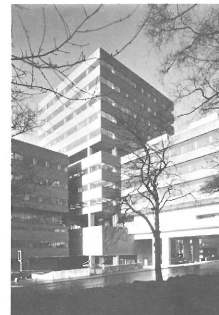
The Claremont Tower