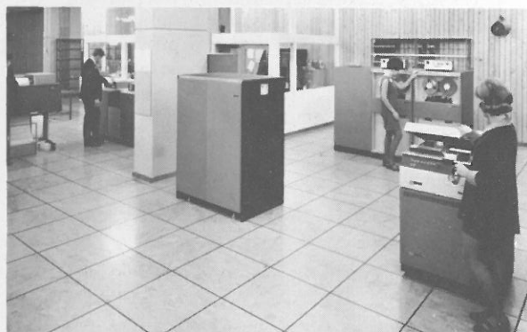
Peripheral units of the 360/67 computer.